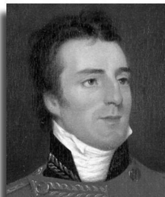
Lt. Gen Wellesley

What is more important than a figure ratio is the relative frontage of the represented unit; this goes hand in hand with the selected ground scale. Essentially every inch or millimeter of a tabletop unit frontage represents a certain number of men, relative to the formation and number of ranks and files represented by the unit. Representation of unit formations on the tabletop is generally a compromise, particularly when considering columns and square formations, where the physical footprint or width is not a true reflection of the actual historical formation. The basic line formation frontage, however, should be as relatively accurate for gaming purposes as possible, and especially consistent across the units represented on both sides of the table. Using this principle, the charts on the previous pages, are provided as guidelines to typical unit frontages represented within the army lists. However, it is not necessary to rebase your existing collections to suit these frontages. Essentially, your figures can be mounted to whatever basing system you prefer, but you should ensure that the unit frontages are obviously representative of the intended unit size. For example, if you have a unit that represents 500 men, it should be narrower than another unit representing 640 men. In this example, simply ensure that the relative frontages are obvious, without necessarily being exact. Large cavalry formations are in some cases split into two or more separate units; these are