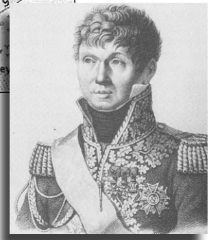
Peninsula, July 1809 Lt. General Arthur C. Wellesley / General Cuesta Marshal d'Empire Claude Victor Perrin